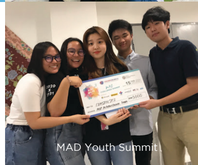
MAD Youth Summit