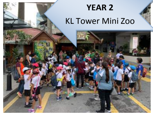
YEAR 2 KL Tower Mini Zoo