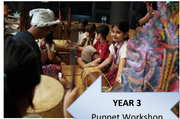
YEAR 3 Puppet Workshop