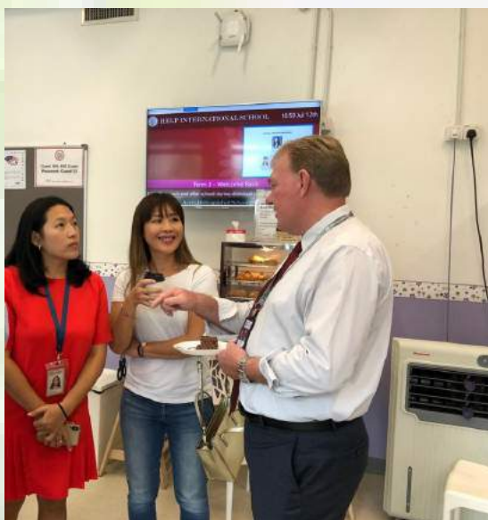
Engaging with HIS parents at school.