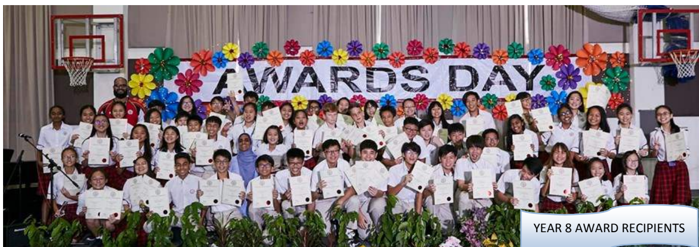
YEAR 8 AWARD RECIPIENTS

The Years 7 & 8 Awards Day Programme Book may be downloaded from this link: