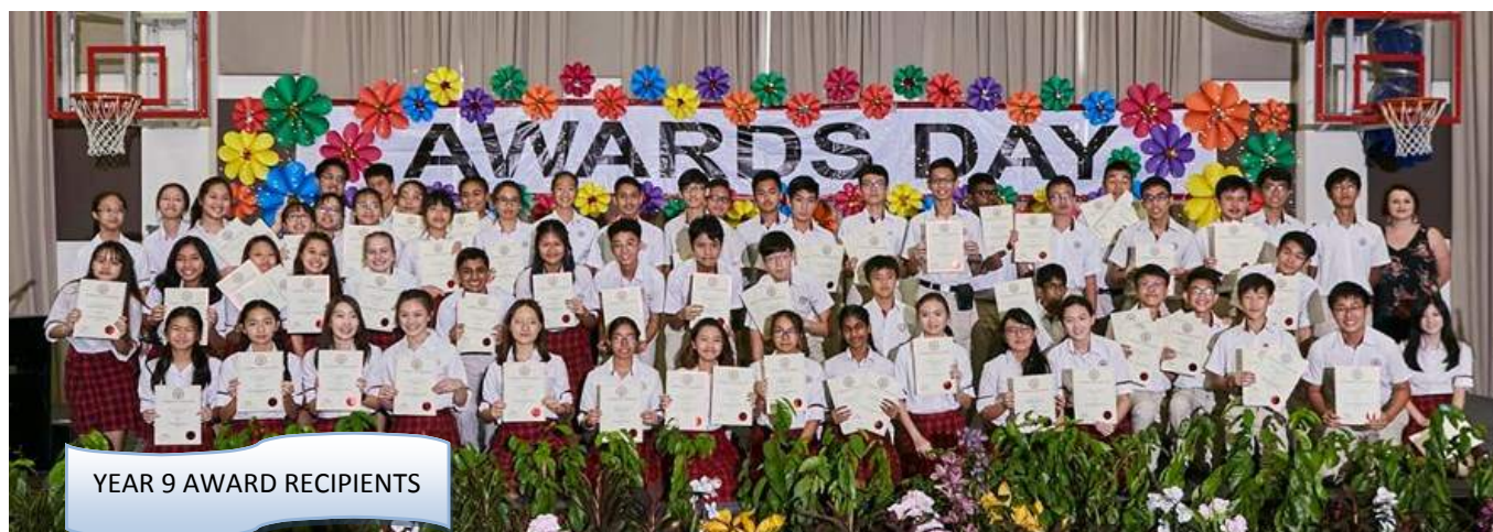
YEAR 9 AWARD RECIPIENTS