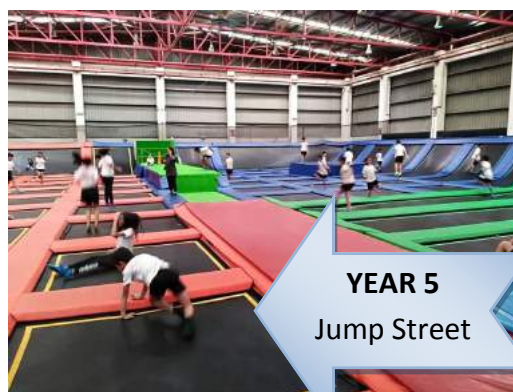
YEAR 5 Jump Street