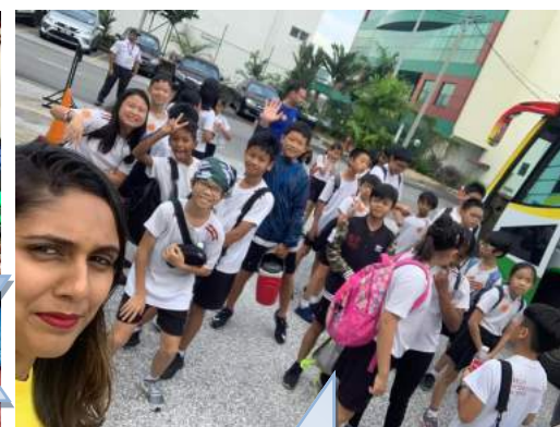
YEAR 6 Penang