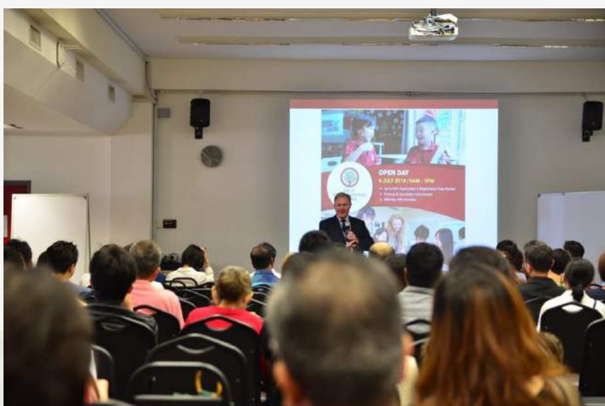
Addressing prospective parents at a recent HIS Open Day.