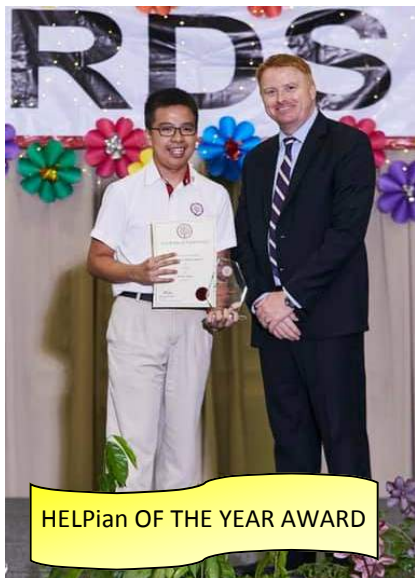
HELPian OF THE YEAR AWARD