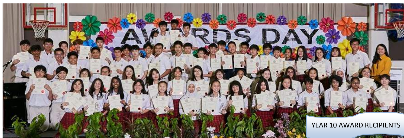
YEAR 10 AWARD RECIPIENTS

The Years 9 & 10 Awards Day Programme Book may be downloaded from this link: