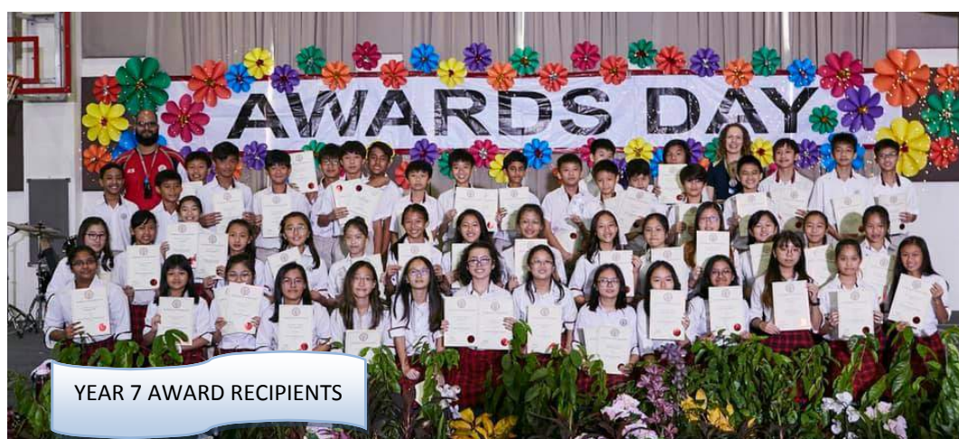
YEAR 7 AWARD RECIPIENTS